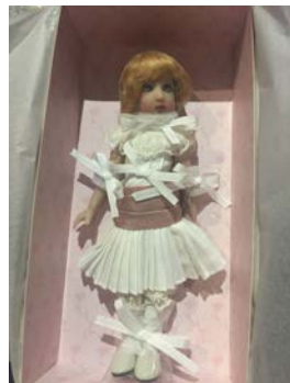
The Second picture is the convention doll, Ma Petite, by Helen Kish.

This fall looks to be busy! I will be visiting clubs and going to luncheons and shows, setting up with my informational table.