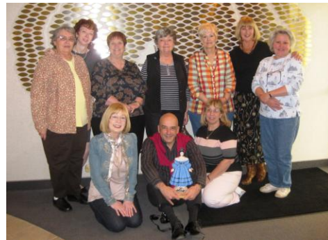
Newly trained Regional Directors