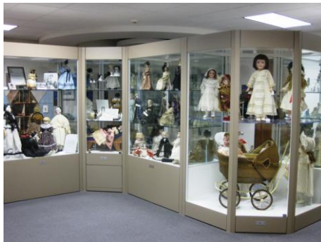
Display cabinets at UFDC Headquarters