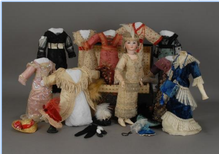
COD Lady and Wardrobe

They can be reached at 252-0041 at their website www.legacydollmuseum.com .