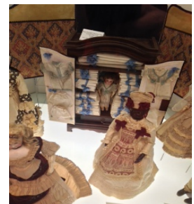
Doll Linen Cupboard

MEMBERS AT LARGE LIVING IN THE PORTLAND, OREGON AREA – Meet me at the Crossroads Show on 9-5-2015 at the UFDC booth at 11:00 am. We'll talk about a new club within driving distance from Portland, OR