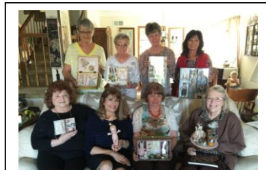
Doll Dreamers of Southern California