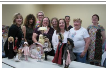
Best Little Doll Club of Orange County "Tonner" Doll Luncheon