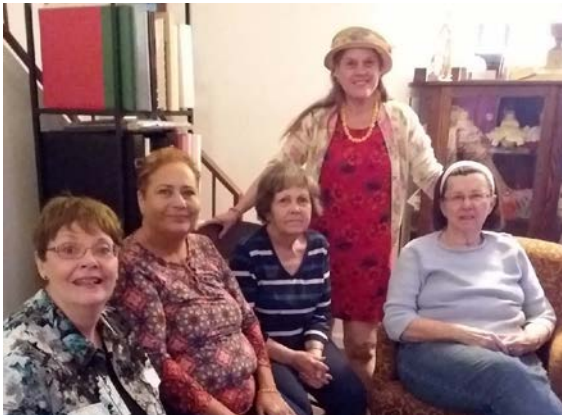
April 3 Time After Time Doll Club Lakewood, CO