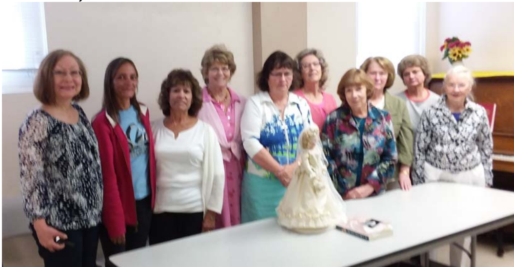
May 15 Denver Dollars