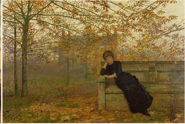
"Autumn Regrets" Grimshaw